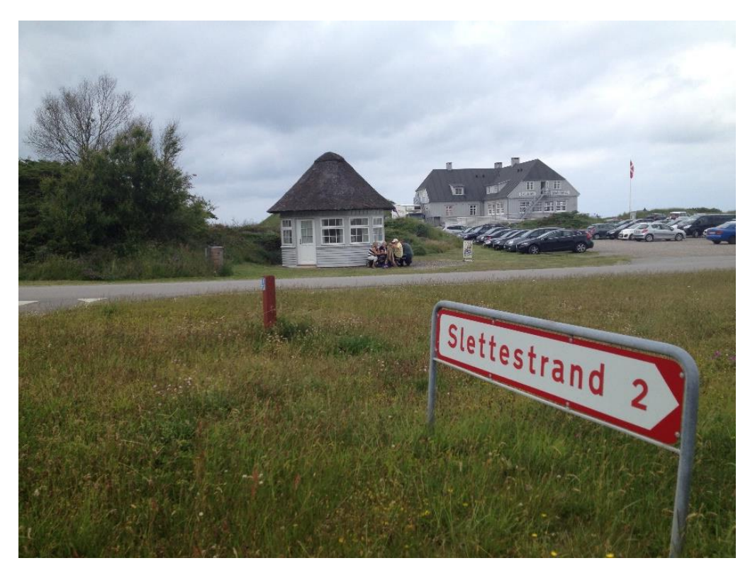
Turn left up hil