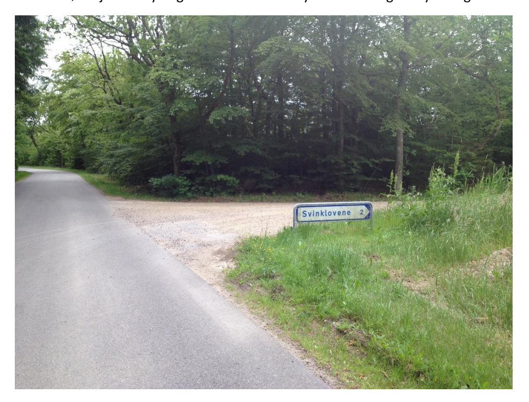
If you drive in a car drive carefully because bickers might cross Mountainbike track Slettestrand/Svinkløv The road ends at Svinklovene – now there is a fencing for island horses