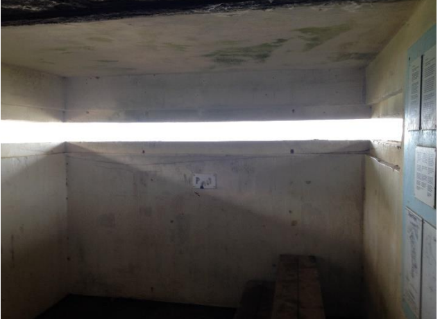
And to the East towards Svinkløv